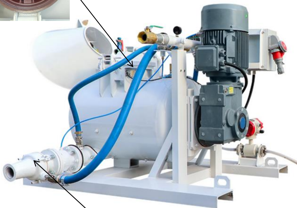
Special swirl adding air design