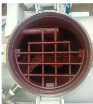
Internal mixing system